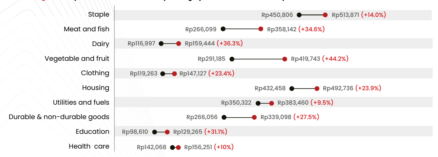
Figure 2. Impact of reduced tobacco spending by 50% on household's expenditure on other commodities

(44.2%), dairy products (36.3%), and meat (34.6%). In addition, reduced tobacco spending will also put an additional budget for spending on education by 31.1%, health care (10%), housing (23.9%), clothing (23.4%), and utilities (9.5%)